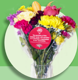
FEBRUARY IMAGE EXAMPLE Click here to browse all Images

Before your month begins, start spreading the news! Below is a sample press release. Just add your organization's information and distribute to your local news outlets. Or click above to download the template and explore other resources. Print and post the flyer on the following page or check out the Image of the Month. Many more options are available in our Resource Center.